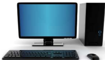
Automated Slide Sorter, Stage, Microscope, Digital Camera and Computer System

The Peltier cooled, 1376 x 1032 pixel camera offers exactly what users in diagnostics, research, development and quality assurance need: high resolution, fast frame rates and very high sensitivity with an excellent signal-to-noise ratio, broad dynamic range and superior image quality. As a result the camera offers images rich in detail and contrast with extraordinary low background noise. Digital camera performance optimized for laboratory requirements.